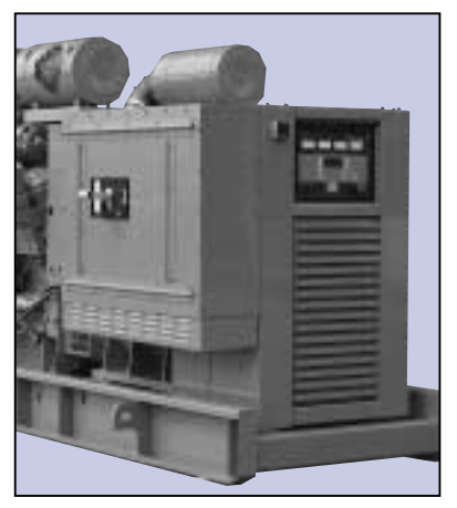
Circuit breaker can be fitted either side of generator set.

These systems include an extensive array of standard control and digital display features that eliminate the need for discrete component devices such as voltage regulator, governor, and protective relays. The PowerCommand Digital Paralleling Control also eliminates the need for separate paralleling control devices such as synchronizers and load sharing controls.