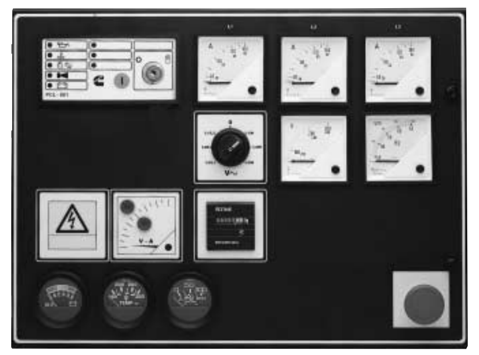
PCL/Power Control - standard configuration PCL-001